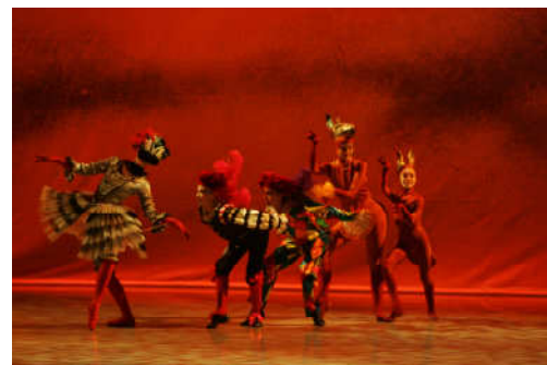
Carnival of the Animals